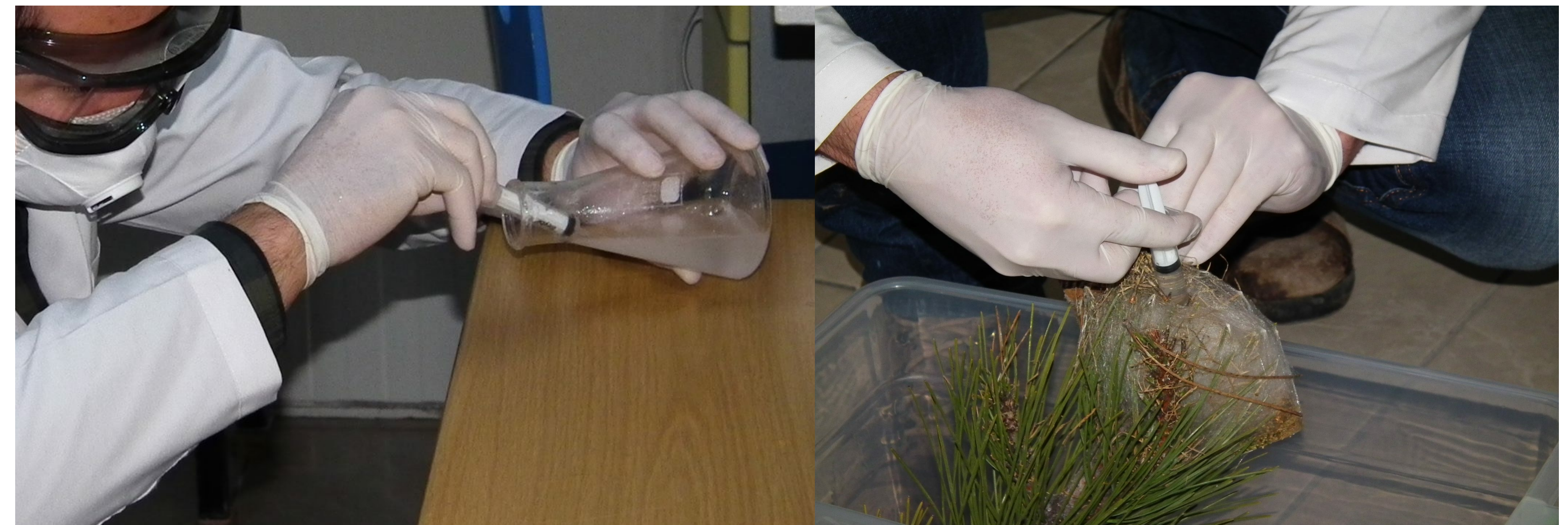
Fig. 3. Plant oil injections to PPM nests .

PPM larvae are nocturnal. Forcing the larvae to leave the nest during the day increases the likelihood of them being killed by predators. The exact mechanism by which the oils kill the larvae is unclear but we postulate that the oils may act as con-