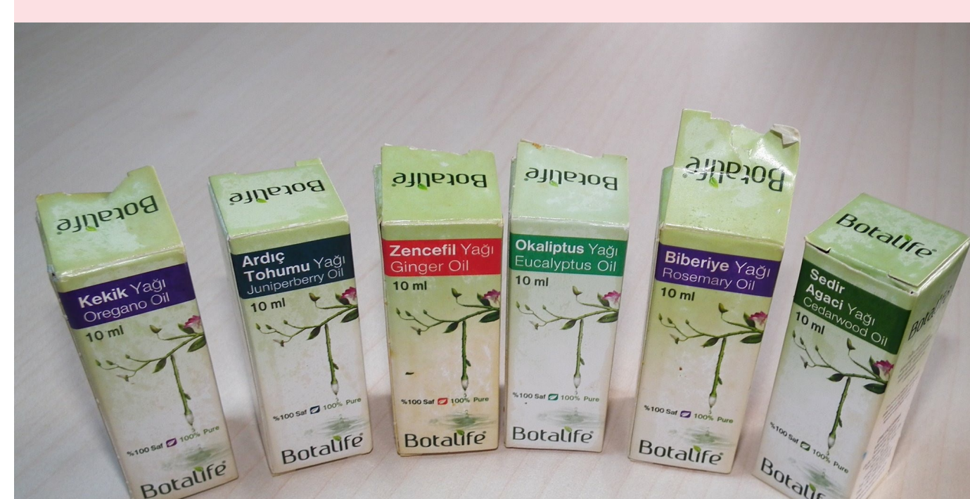
Fig. 3. Locally obtained oils of oregano, juniper berry, ginger, eucalyptus, rosemary and cedar wood .