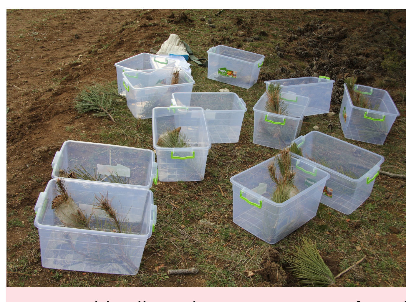
Fig. 2. Field collected PPM nests transferred to laboratory with plastic containers.