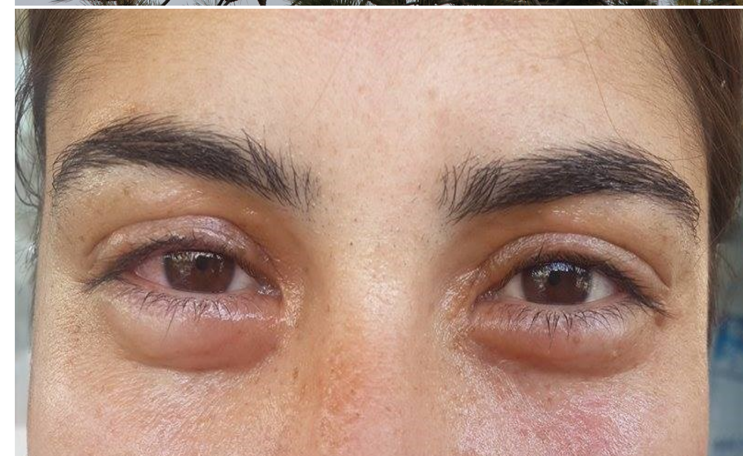
Fig. 1. PPM infested pine trees in Isparta/Turkey (upper) and Intense contact urticaria with associated angioedema on the student face (below).