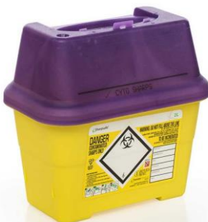
Figure 2 – Example of purple-lidded yellow body box

All solid and sharps waste contaminated with infectious clinical waste and contaminated with cytotoxic and cytostatic substances must be placed into purple-lidded sharps box for disposal.